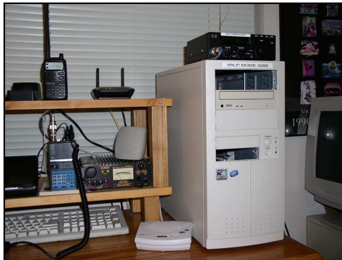
My IRLP computer & link radio-Node 3285